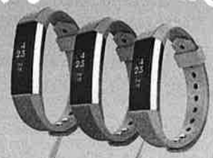
7 x Fitbit Aces