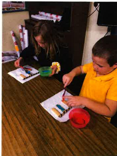
Kodomonohi (Japanese Children's Day) - making decorated biscuits for Koinobori, the carp streamer people put up on Children's Day.