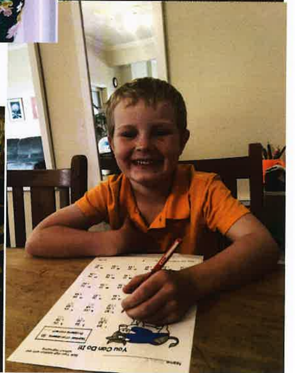
Natimuk Primary School is committed to being a Child Safe school