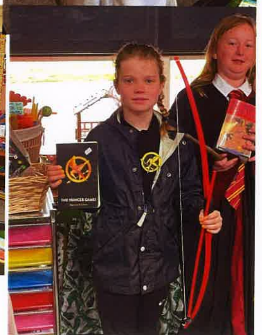
Natimuk Primary School is committed to being a Child Safe school