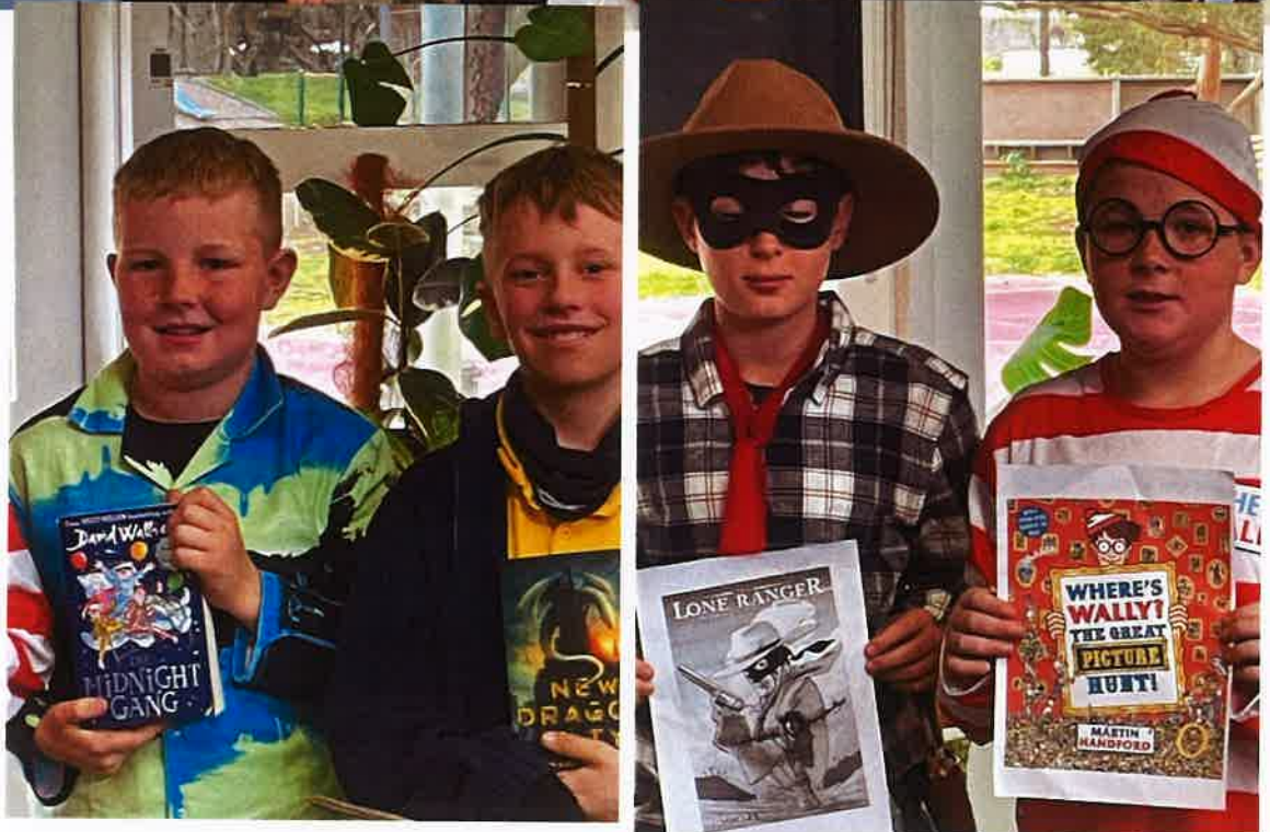
Natimuk Primary School is committed to being a Child Safe school