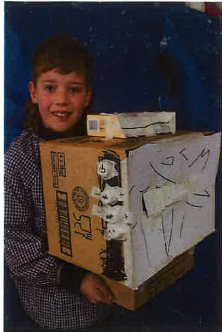
Elliott constructed a TV with a smashed screen