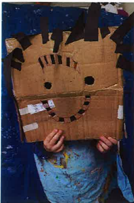
Brock made a scary mask