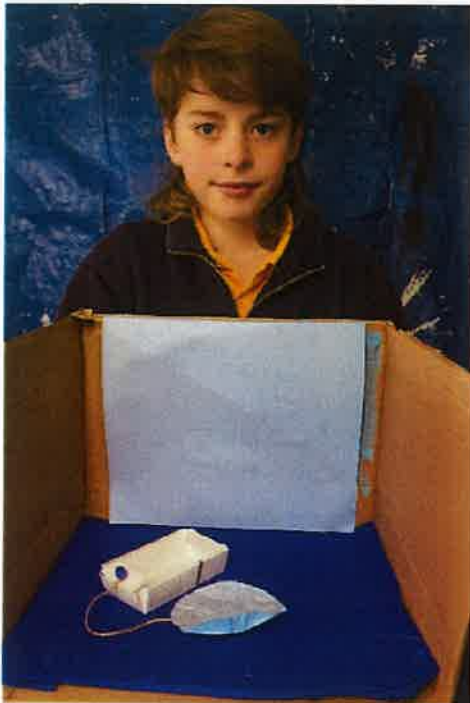
Benson and Zarnie made a speed boat