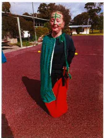
Natimuk Primary School is committed to being a Child Safe school