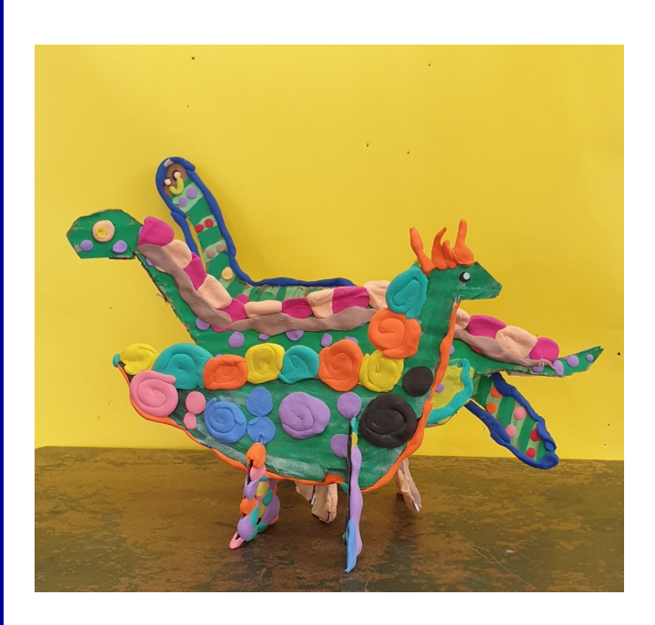
Art & Drama