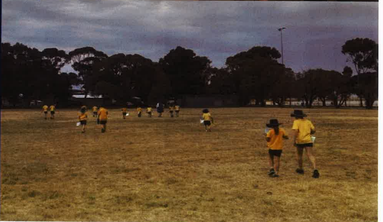
Natimuk Primary School is committed to being a Child Safe school